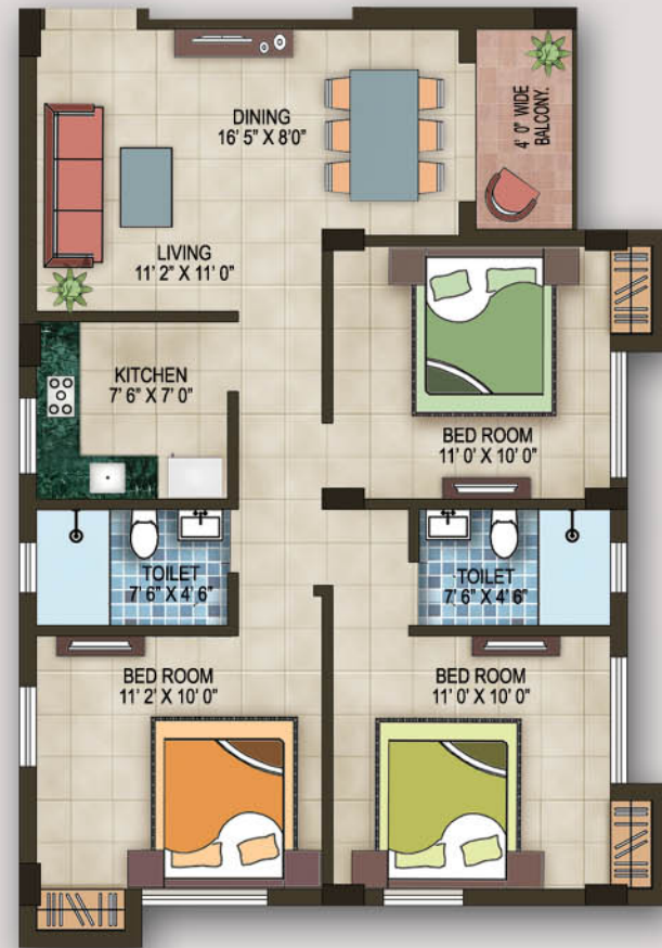
Flat A (3 BHK - 1105 sq ft.)