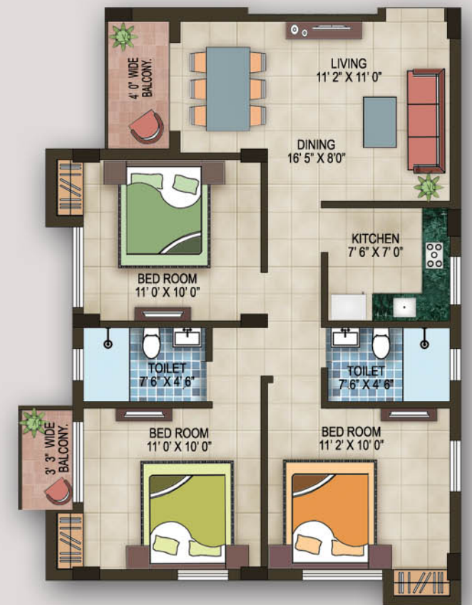
Flat H (3 BHK - 1133 sq ft.)