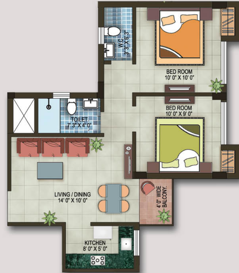
Flat B & G (2 BHK - 742 sq ft.)