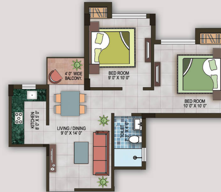
Flat E (2 BHK - 670 sq ft.)