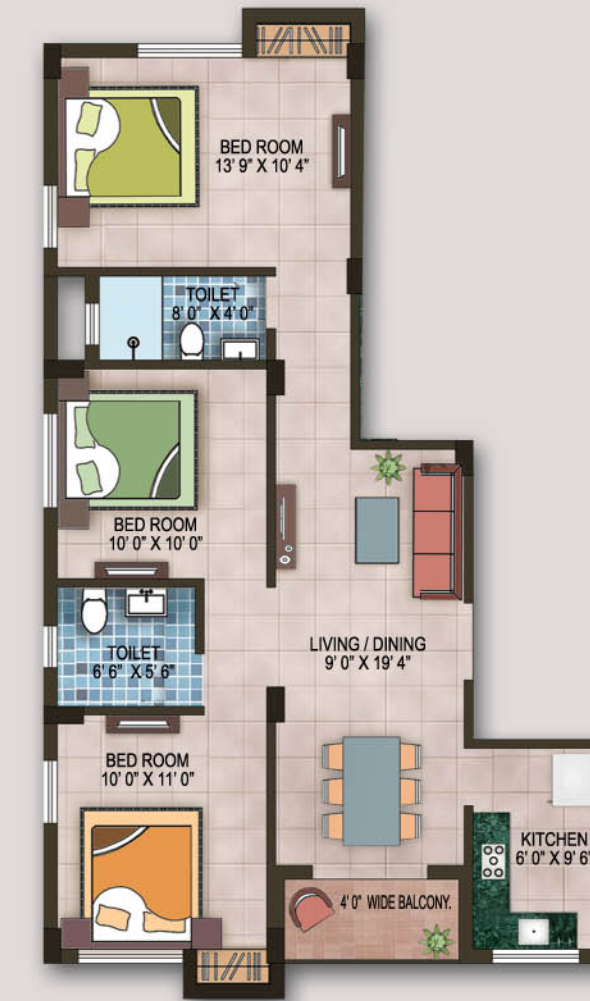
Flat F (3 BHK - 1134 sq ft.)