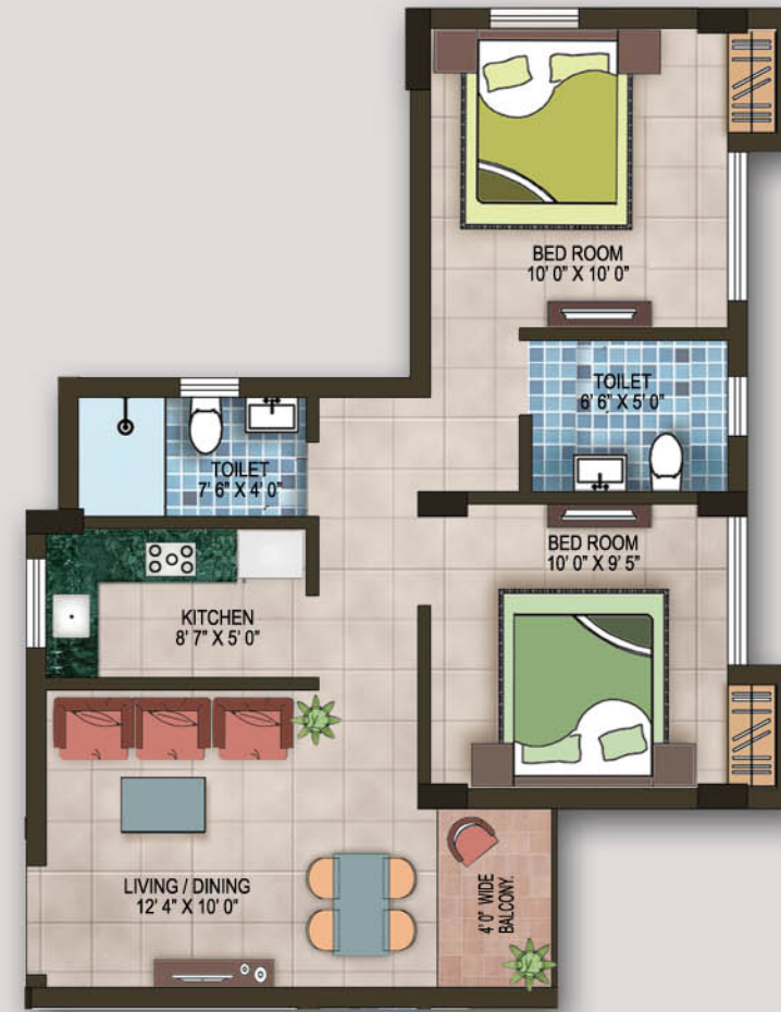
Flat C & D (2 BHK - 796 sq ft.)